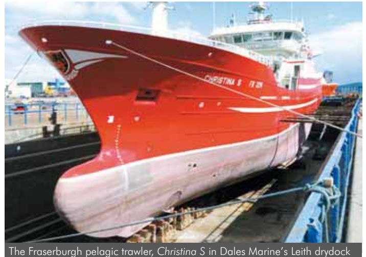
The Fraserburgh pelagic trawler, Christina S in Dales Marine's Leith drydock