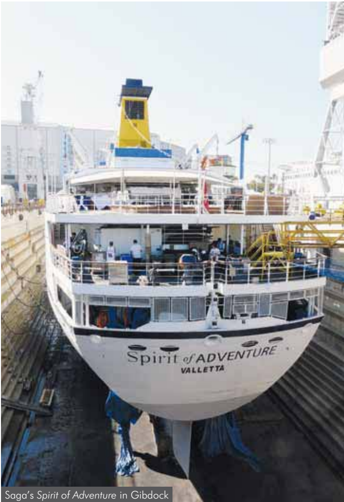
Saga's Spirit of Adventure in Gibdock