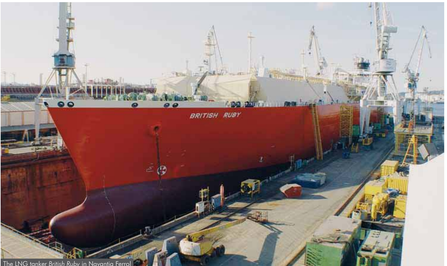
The LNG tanker British Ruby in Navantia Ferrol

MOL Tankship Management's four vessels involved were the 51,441 dwt chemical tanker Noble Express , which underwent a complete overhaul of the main engine, the 48,635 dwt product tanker Opal Express , the 30,938 dwt chemical tanker Saamis Adventurer , which underwent steel